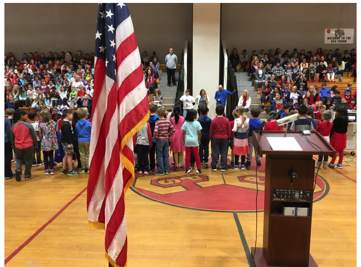
Honoring our Veterans!