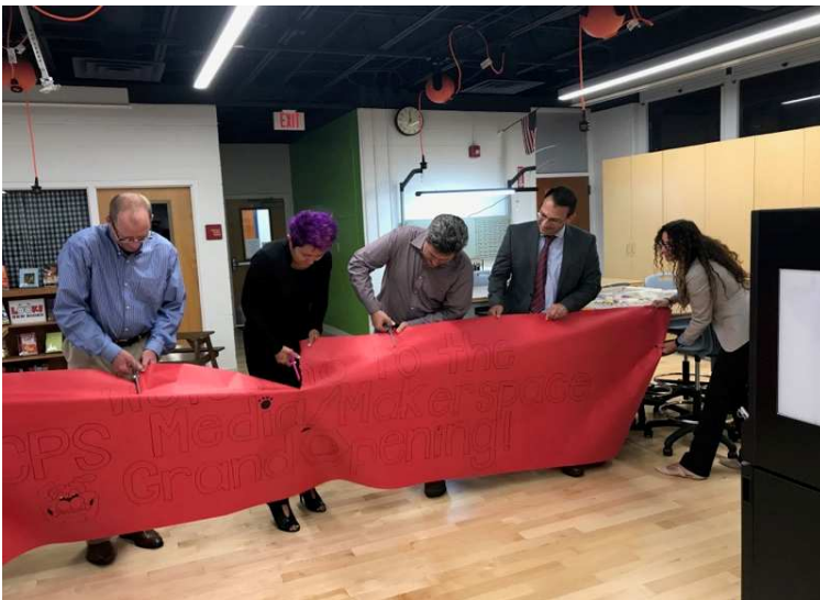
MakerSpace Grand Opening