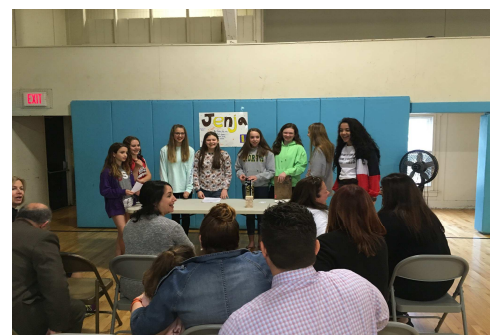
Peer 2 Peer Year End Seminar

10 School Street, Clinton, New Jersey 08809 • 908-735-8512