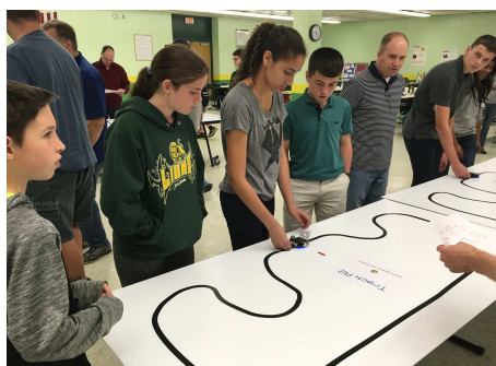
Completing the Course!