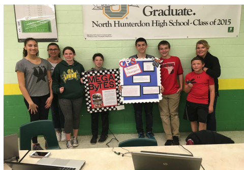
Rotary Robotics Challenge!