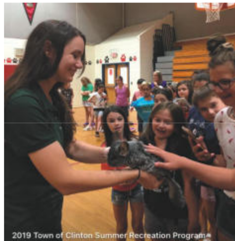
2019 Town of Clinton Summer Recreation Program